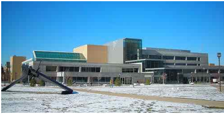
The Merrill-Cazier Library

For example, Special Collections has a unique assembly of cowboy poetry. Why