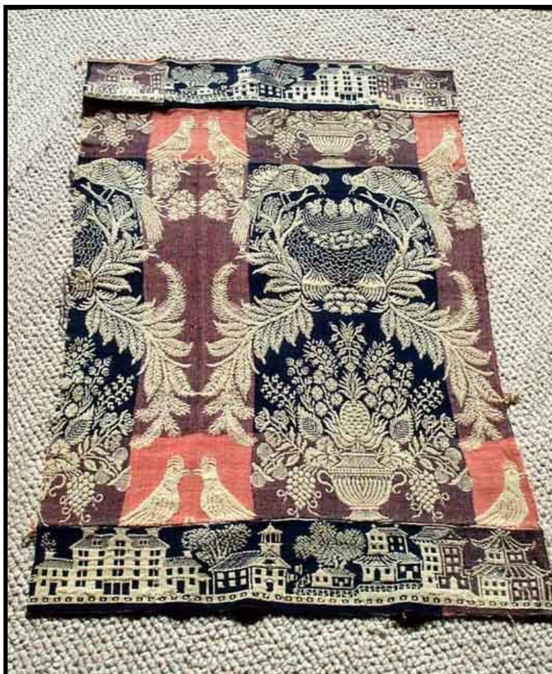
The Neely Tapestry 6

Glenn wrote back and asked if I could e-mail a picture of the tapestry. So, out came the new camera and the tapestry. I found the perfect place on the beige carpet with the afternoon sun shining on the carpet. The picture was taken, transferred to the computer, and sent off to Glenn that afternoon.